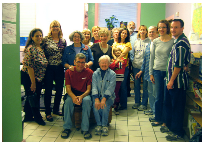
Volunteers from Unitarian Church of Evanston