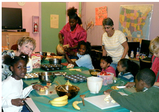
A delicious Saturday morning breakfast to celebrate the opening of The Jonquil Hotel’s new kitchen.

Also thanks to UCE for putting on the “Night of the Arts” event. Several members of the Unitarian Church partnered with residents in the North of Howard neighborhood for a fun night of crafts and fellowship. Participants forged new friendships and designed many beautiful creations.