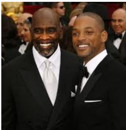
Chris Gardner, with Will Smith, from the movie 'Pursuit of Happyness'

Good News Partners is pleased to announce our keynote speaker for our 2012 Annual Fundraiser: Chris Gardner. He may not be Will Smith, but Chris Gardner is the real thing! His story, about the challenges of being homeless, became a No. 1 bestseller known as The Pursuit of Happyness . The story was turned into an award winning movie in 2006, starring Will Smith as Gardner.