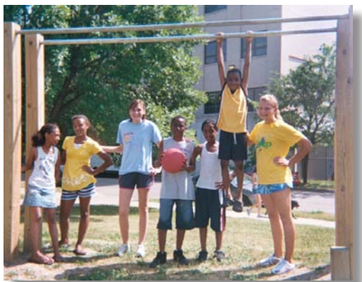
Volunteers building relationships with neighborhood children—one of the most valuable components of partnering with GNP.