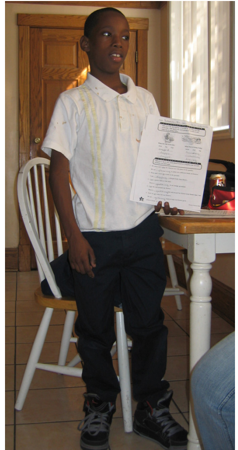
Gift cards for School uniforms appreciated!