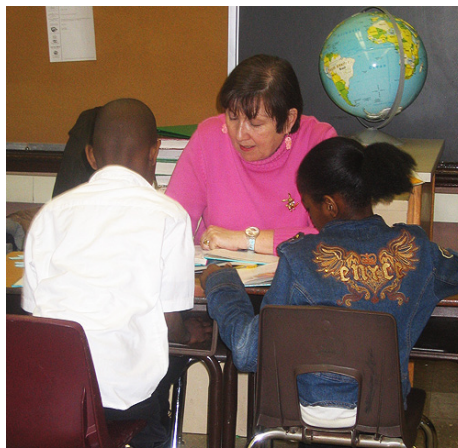
Kids test scores soar with Reading Coaches