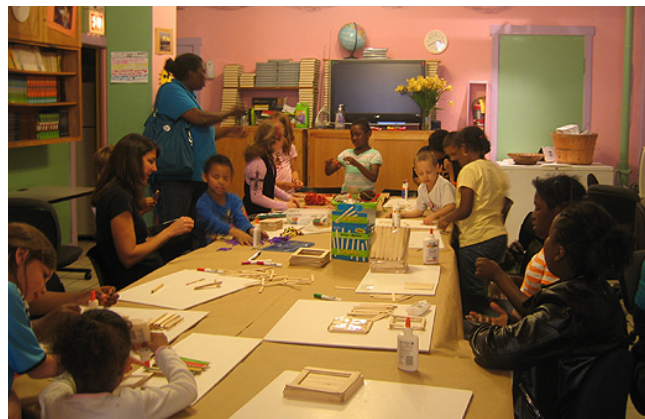
Birthday Party Kids share their gifts