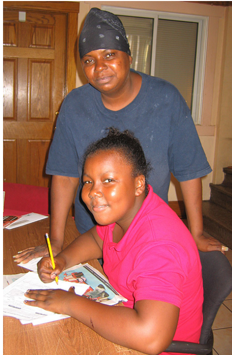
Parents + Kids + Homework = success!

Thanks to all who partner and support this community in such tangible ways!