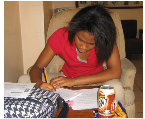
Homework starts after school at The Jonquil