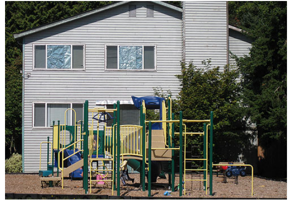
Affordable Housing for Mom's and Kids in Seattle, Washington