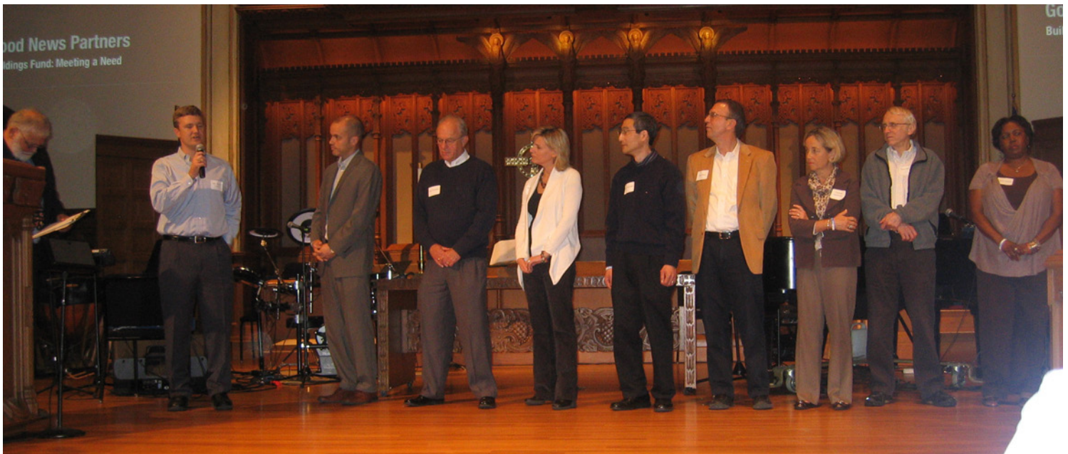
Representatives from Collaborative Churches focus on ending homelessness

Check our website for more information on the Church Collaborative initiative www.goodnewspartners.org .