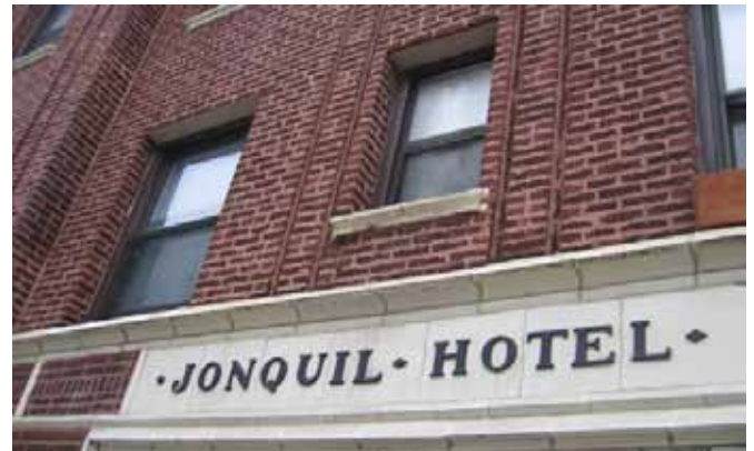
Jonquil windows were weatherize