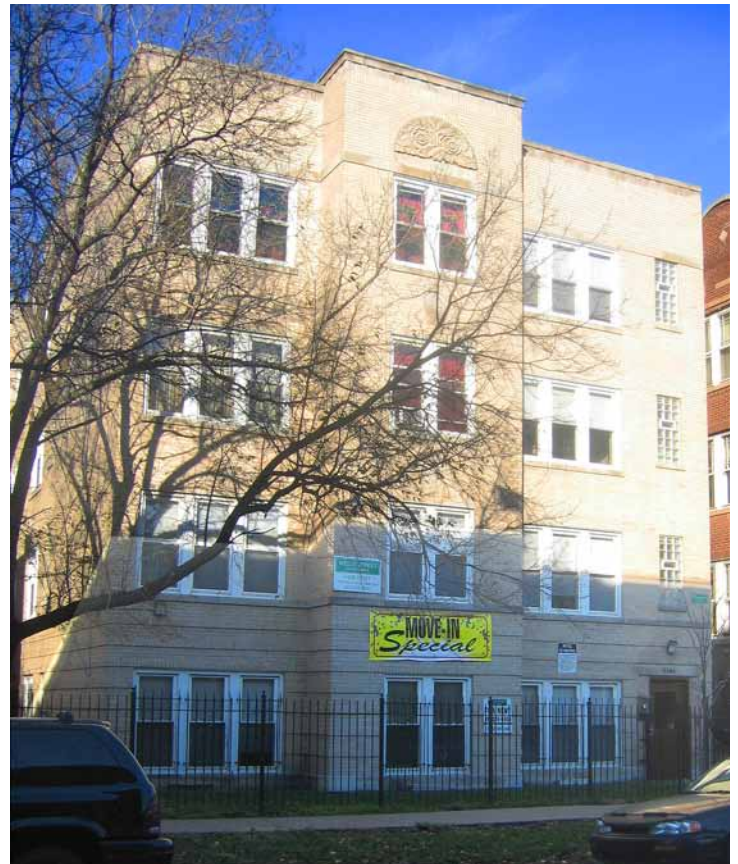
1546 W. Jonquil Terrace now provides 27 units of affordable housing for GNP